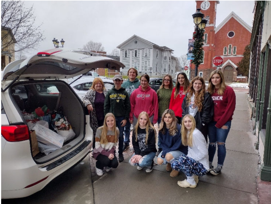
Holley Honor Society handed out food and gifts at the Eastern Orleans Community Center.