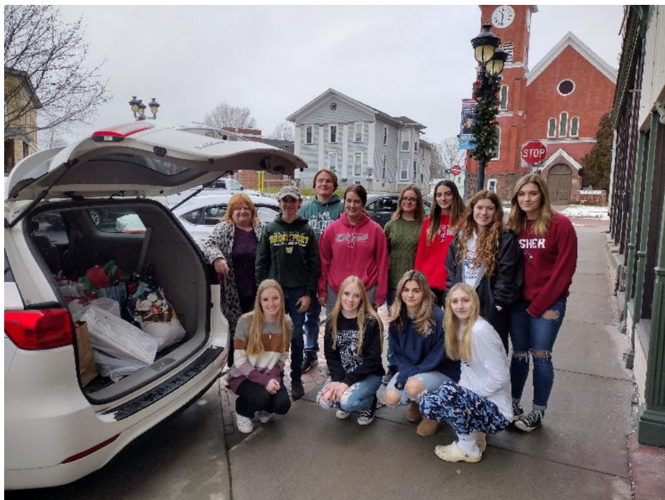
Holley Honor Society handed out food and gifts at the Eastern Orleans Community Center.