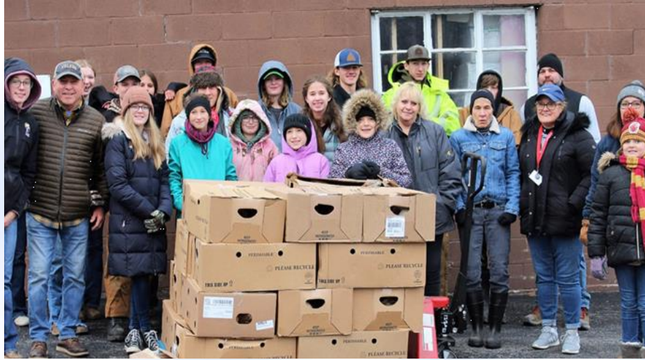
Volunteers Sorted and Organized Toys for 100 Local Children.