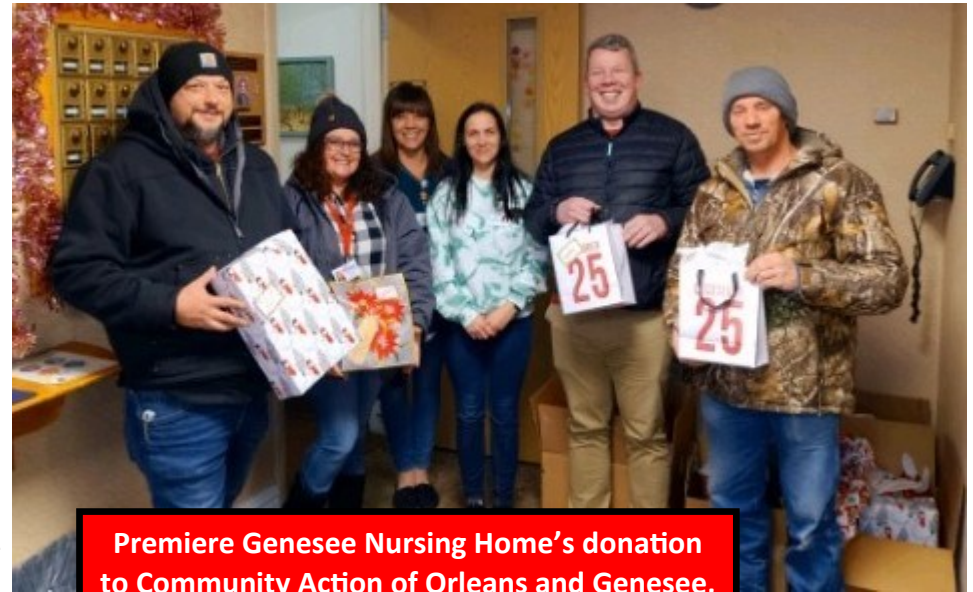
Premiere Genesee Nursing Home's donation to Community Action of Orleans and Genesee, for Batavia's Christmas Program.