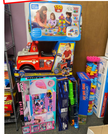
Lots of toys were donated!