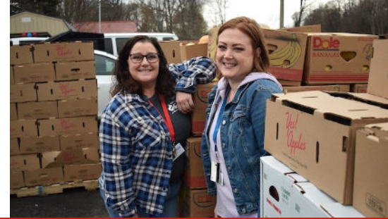
Albion High School FFA donated 37,000 pounds of food to the Albion Food Pantry!!