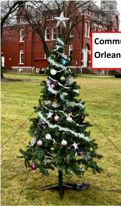
Community Action's Tree on the Orleans County's Courthouse Square.