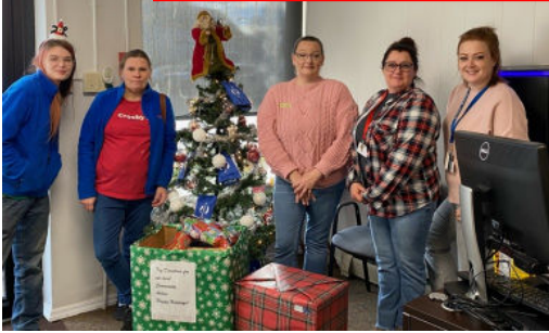
Donation from Crosby's