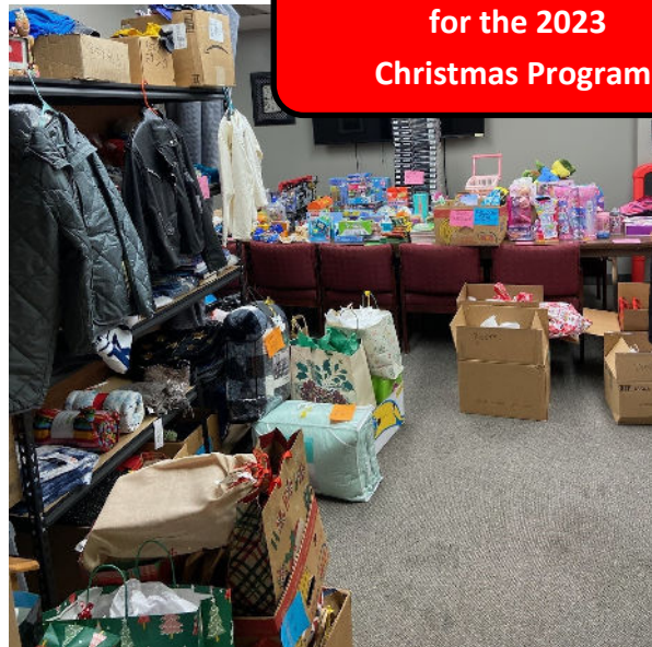
Some of the donated gifts for the 2023 Christmas Program.