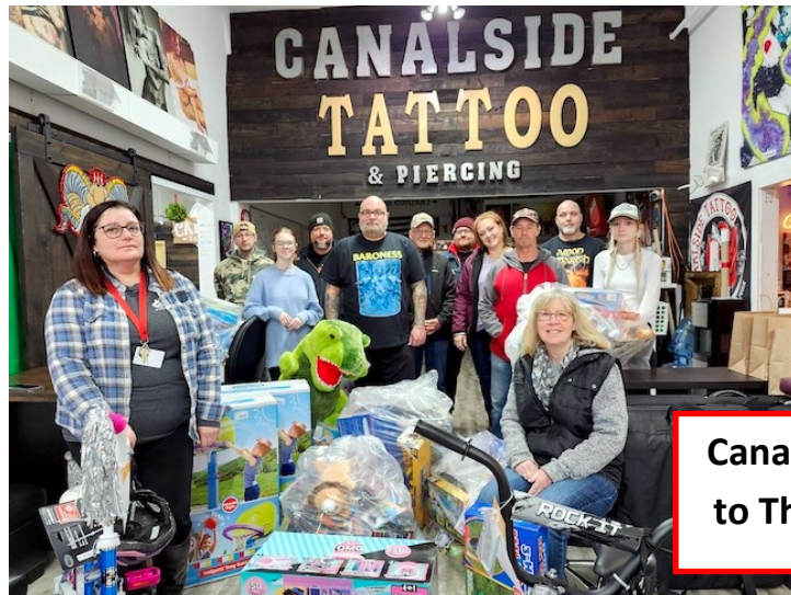
Canalside Tattoo donated to The Holiday Toy Fund.