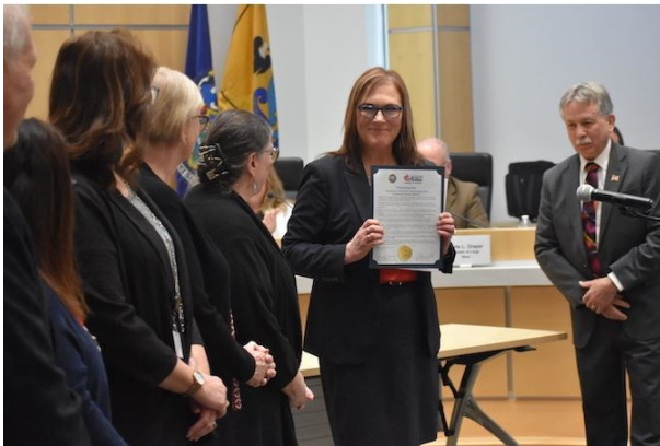
The Orleans County Legislature presented a proclamation in honor of Community Action's 60 th anniversary and also May as Community Action month.