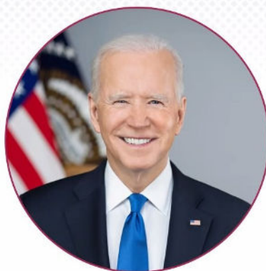
Joseph R. Biden, Jr. The President of the United States